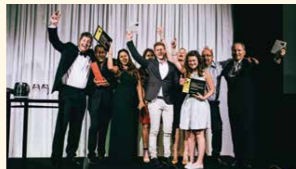
2015 Franchisee of The Year Winners - Columbus Glen Eden and Columbus at Mitre 10 MEGA Kapiti/Porirua.